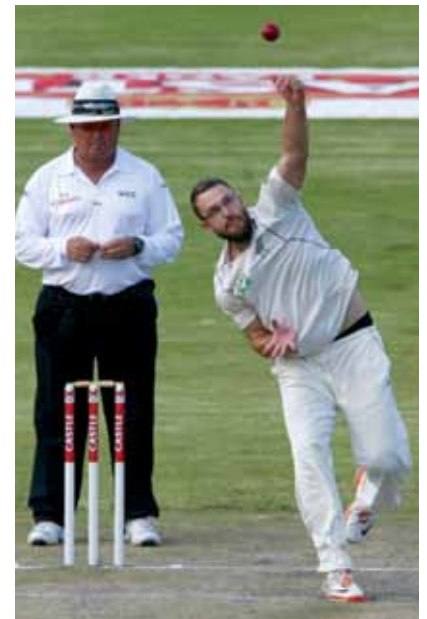
BELOW: Daniel Vettori during the Test match against Zimbabwe in November 2011.