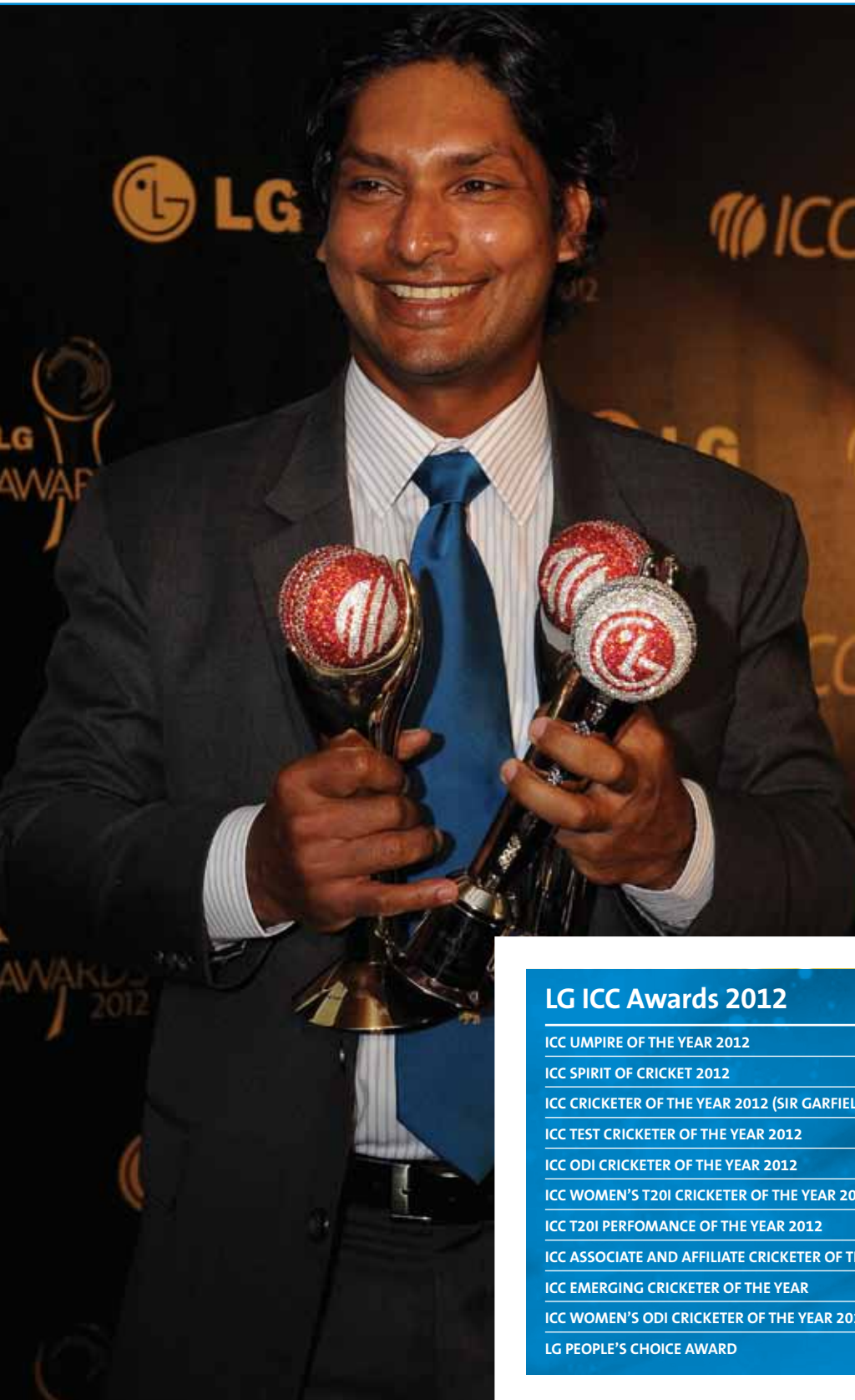
MAIN: Kumar Sangakkara displays his three Awards at the LG ICC Awards 2012.